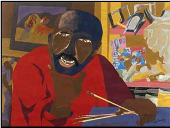
Self Portrait, Jacob Lawrence