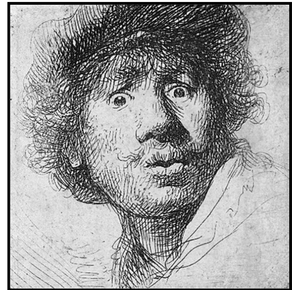
Self Portrait in a Cap, Rembrandt

Late assignments will be accepted up to one week from the due date, but will only be eligible for 70% of credit earned. Sketchbook assignments will not be accepted late. One “Oh CRAP” late coupon will be issued for one day of lateness without penalty (restrictions apply – see coupon).